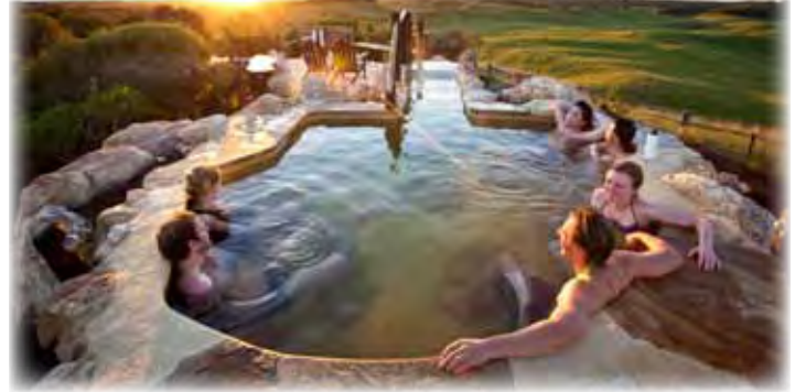
Hilltop pool (Bath House)

Note also that your partner can bathe in the Spa Dreaming Centre pools while you have your treatment for just $45 off peak, $50 peak.