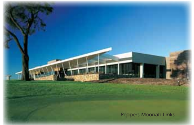
Peppers Moonah Links

Note also that your partner can bathe in the Spa Dreaming Centre pools while you have your treatment for just $45 off peak, $50 peak.